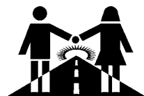
COUPLES CHECK-UP a Study led by Doug Hodges that includes an on-line assessment

Couples Check-Up ..... C101 How is your marriage? What would your spouse say? There is a great tool available to you called Couples Check-Up . Take the time now to be proactive about fireproofing your marriage. Don't wait until the fires start! An interactive study. Begins Nov. 5